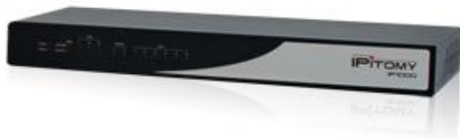
IP1000 - Router / Firewall / Pure IP PBX

Go to IPitomy.com for more details and a complete list of features.