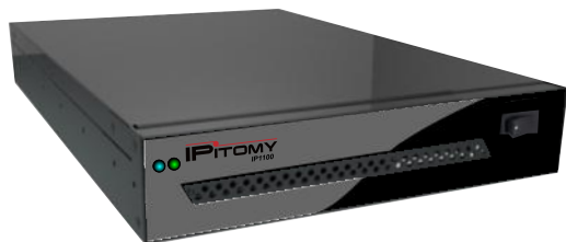
IP1100 - Pure IP PBX

Go to IPitomy.com for more details and a complete list of features.